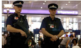
Policemen on duty at Manchester airport after the terror arrests today